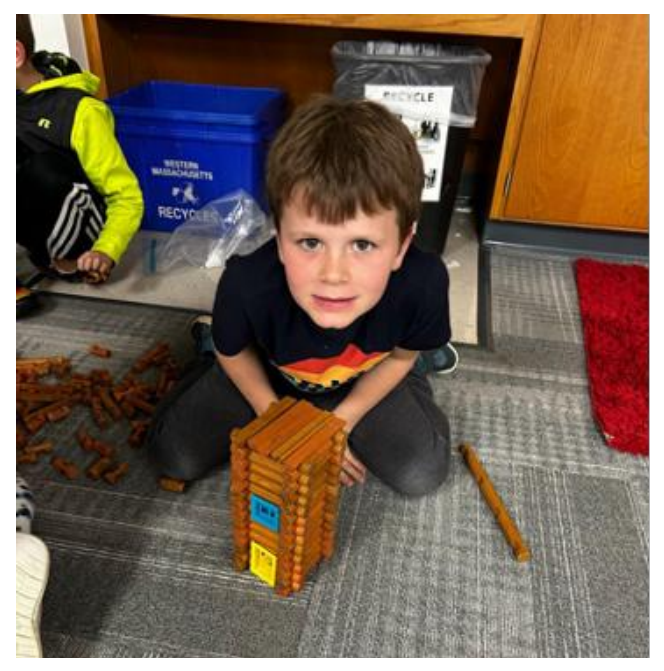
Continued on next page...