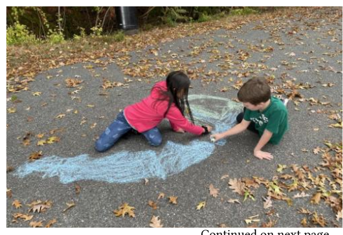
Continued on next page...